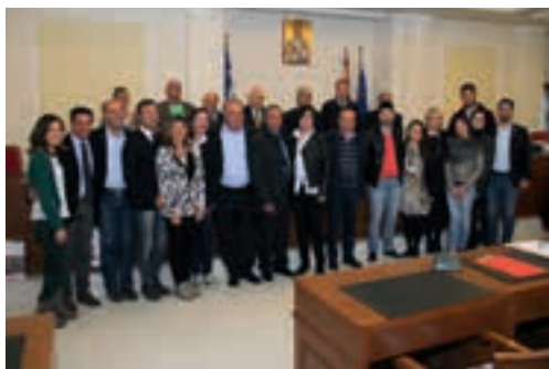
Attendance of the Conference: EU- funding in local higher education