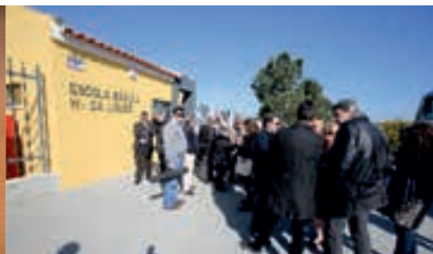
“Presentation of New Technology Educational Tools – Oratio Classroom at the “Escola Básica da Lousã”