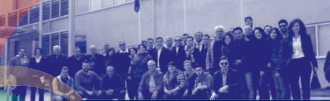
Study-Visit at Kastoria's Department of Technological Education Institute of Western Macedonia