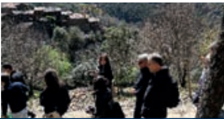
"Field-visit in "Schist Villages", project for the touristic renovation of a rural territory"

Between the 14th and the 18th of March 2015, inserted in the program "Europe for the Citizens", we welcome at Lousã a meeting of this important network of collaboration.