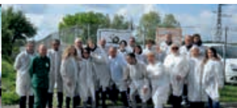
"Field-visits at Pisciculture (fish farm) "les Etangs d'Occitanie" and the oil-company "Bio Planète"