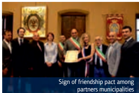
Sign of friendship pact among partners municipalities