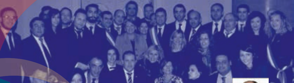
"Welcoming of the delegations by the President of the Republic of Malta, her Excellency M' Louise Coleiro Preca"